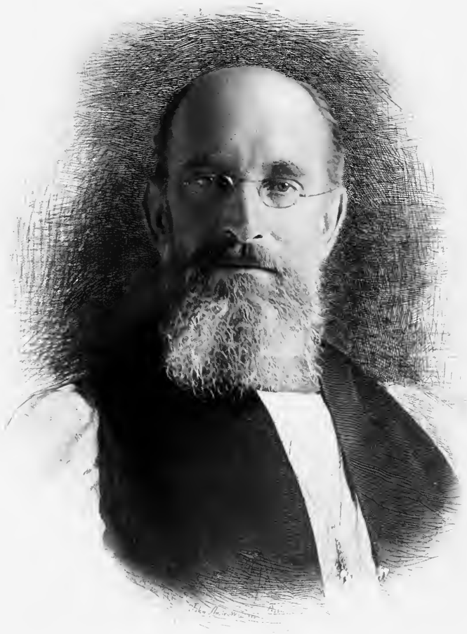
THE BISHOP OF LONDON.